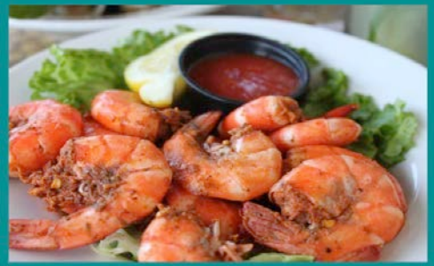
KEY WEST PINK U-PEEL SHRIMP

Broiled to perfection and ready for you to peel & eat. Served hot or cold with our Cocktail sauce. ½ lb - 9.99 / 1 lb - 17.99 / 2 lb - 35.99